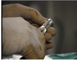
Surgeon prepares medical grade coral for Fusion of the spine.

It is important for us to interview the victim as soon as possible and document their surgeries, treatments and rehabilitation throughout the case