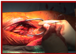
Frame from actual video production.

Thomas added, “Today’s juror, adjuster, or mediator is accustomed to seeing fairly high quality from their cable or satellite transmission. A production that provides any less quality level will be perceived in a negative manner. It may be subliminal but it will influence the viewer. We create productions that are at as good as the quality they see at home, in many cases better”