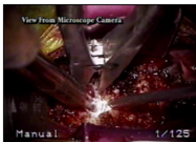
Microscopic view of cervical surgery from a video production.

It is important for us to interview the victim as soon as possible and document their surgeries, treatments and rehabilitation throughout the case